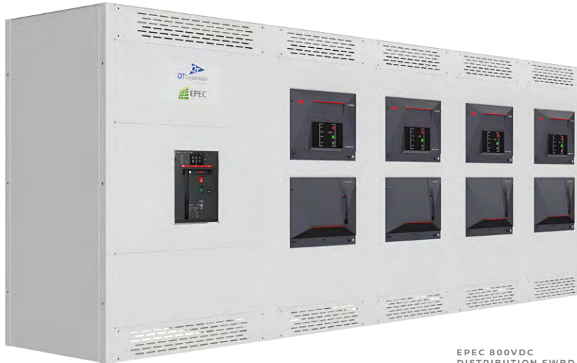
EPEC 800VDC DISTRIBUTION SWBD